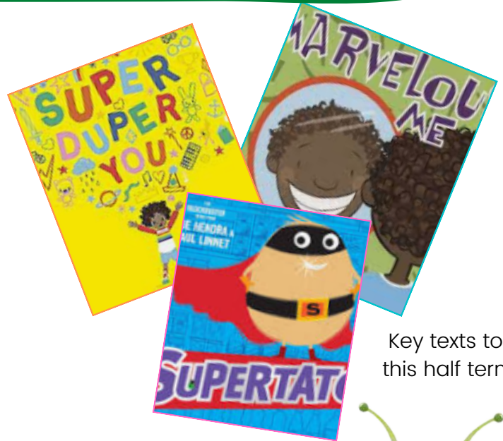
Key texts to this half term

We teach through key texts, exploring a range of vocabulary. Above are pictures of the key texts we will be using this half term.