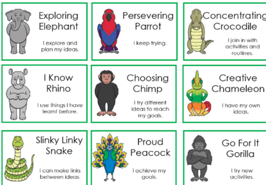
Our learning zoo.

The first set of sounds we will explore are: s a t i p n