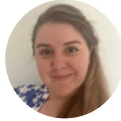
Miss Code DDSL