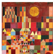
Castle and Sun by Paul Klee